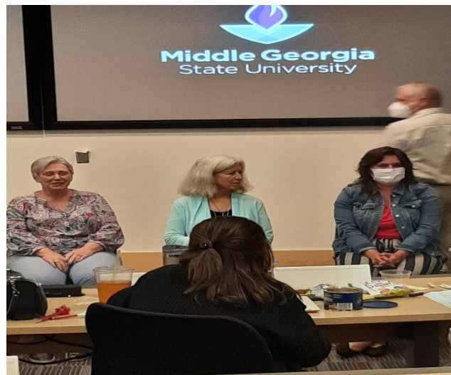
The 2022 Spring State-wide Training Conference was held at Middle Georgia State University in Macon, Georgia from June 7-9, 2022.