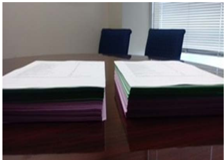
Pictured are the PNA letters and petitions signed by residents.

The governor and law makers have received more than 1,100 signed letters and petitions from Nursing Home residents urging an appropriation to fully fund a $20 increase in the Personal Needs Allowance (currently just $50.00 a month). The increase was authorized in legislation that was passed last year by the General Assembly. Gov. Deal recommended an appropriation that would fund half of the $20 increase. Ombudsman Representatives have worked with facilities and residents to facilitate the letter writing and petition signing campaign for full funding.